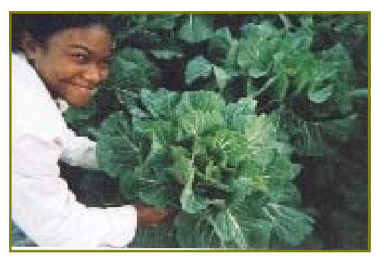
The Gardening and Gleaning Project connected elders and youth to learn traditional practices.

Earlier this spring SFHA opened the community's first African American farmer and craft market on the site of a civil rights era community center. SFHA conducts regular workshops to educate the community about legal issues related to land retention and management, sustainable and alternative agriculture as well as health and nutrition. Two African American families received assistance in developing forest management / stewardship plans; seven families were involved in the community gardening effort; more than a dozen landowners are growing crops for sale at the farmers market; and hundreds of dollars a week are being generated through sustainable uses of lands.