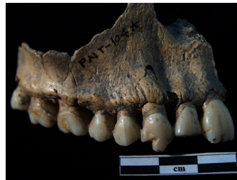
ANTH 689 DENTAL ANTHROPOLOGY.