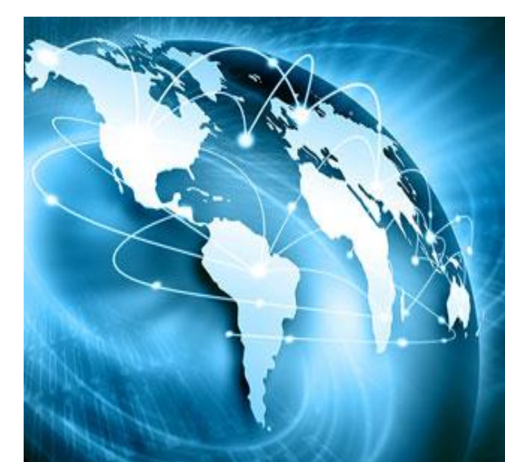
The internet is one of the largest graphs in life.