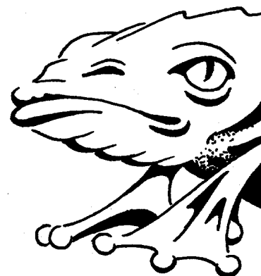
Figure 2.1 Black-and-white versions of the TO