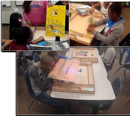
Figure 8 Fifth graders making light-up dioramas of natural resource formation (top left and bottom). Fifth graders make electronic drill to uncover layer of spinach in model of oil formation

that simulate the layers of sedimentary rock as they would form naturally over time (Figure 8). To create each layer, the students would spread a mixture of the salt and kitty litter on top of a layer of spinach leaves using the same motorized sifter that was used in the Maker activity on Mixtures and Solutions. The students observed the spinach as it became rancid over the week.