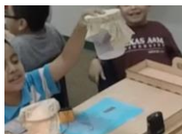
Figure 3 Third grade students observing whether condensation occurs in absence or presence of heat

A 3D-printed mixer head is attached to the motor through a dowel rod so that the student can insert the head into a mixing container and activate the motor. The students built a second electric sifting tool to separate the individual parts of a mixture. This comprised simple hand-held sieve with a vibrating motor attached to it. Activating the vibrating motor by depressing the card switch would shake the sieve to separate its contents.