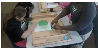
Figure 10 Fifth grade students measuring refraction angle from the LED they connected

Maker activity 2: Later in the week, the students built an electric motorized drill to uncover the “fossilized” spinach to simulate how fossil fuels would be extracted from beneath the earth. They attached a 3D-printed auger head at the end of a dowel rod onto a geared rotating motor. This allowed them to dig through the layers of salt and kitty litter to get at the decaying spinach.