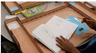
Figure 9 Fifth grade student diagramming parallel and series circuits