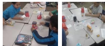
Figure 4 Third grade students making Red-Solo cup robots in a language-arts class: L. Reading fictional stories to find context clues, which they used to create a robot; R. Making their robot character move by assembling circuits with a connected electronic motor

shapes to create a robot character that fit certain context clues. Three popsicle sticks taped to the inverted cup served as the legs of the robot, and a vibrating motor was attached to one of the legs. When the motor is activated using the card switch, the legs vibrate causing the robot to move around.