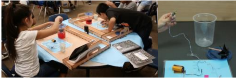
Figure 11 L: Fifth grade students using the mixers they built to dilute Kool-Aid solution. R: The 3D-printed black mixer head, cup, rotating motor, and circuit used during Mixtures and Solutions activities

the text (e.g., between characters and themselves/personal experience and the text, other texts, etc.). Maker activity: The fifth graders decorated the same Red-Solo cup robot used for the third and fourth graders to illustrate their understanding of the fifth-grade-appropriate material they read. They then summarized the stories about the characters represented by the cup robots.