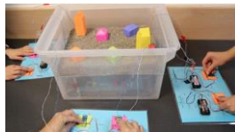
Figure 4 Fourth grade class model prior to earthquake simulation