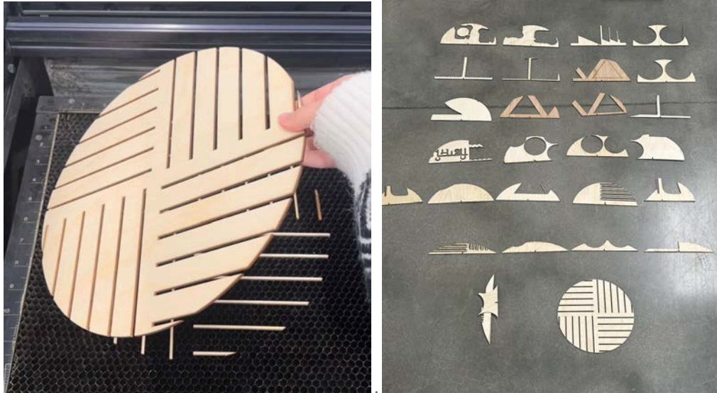
Figure Description: Left: Structure, Right: Cut pieces